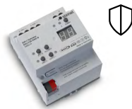
DALI128 KNX-S 2-ch DALI-Gateway EAN 4007841 089214