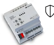
DIM4 KNX-S 4-ch Dimming Actuator EAN 4007841 089191