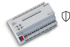
UA16 KNX-S 16/8-ch Universal Actuator EAN 4007841 089177