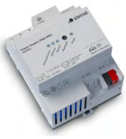
P640 KNX Power Supply 640mA EAN 4007841 084882