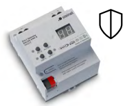
DALI64 KNX-S 1-ch DALI-Gateway EAN 4007841 089207