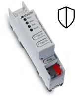
ALC100 KNX-S Area/Line Coupler EAN 4007841 085643