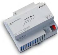
P1280 KNX Power Supply 1280mA EAN 4007841 085667