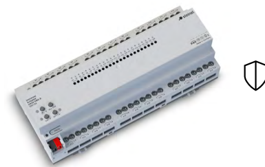
UA24 KNX-S 24/12-ch Universal Actuator EAN 4007841 089184