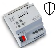
UA6 KNX-S 6/3-ch Universal Actuator EAN 4007841 089160