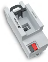
USB100 KNX USB Interface EAN 4007841 085674